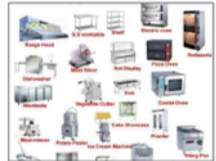
KITCHEN 101 Equipment & Lay Out