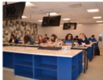
INGREDIENT IDENTIFICATION & Types Of Cuisine