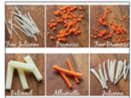
TECHNICAL SKILLS Basic Cuts & Techniques

701 SOUTH CENTRAL AVE. PHOENIX, AZ 85004 | FOR MORE INFO CALL: 602.254.5081