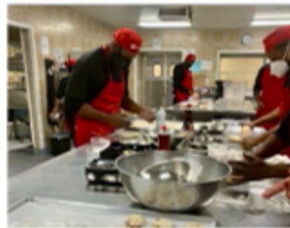
FOOD SAFETY & Sanitation