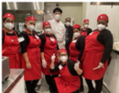
TEAM CULTURE & Kitchen Tradition