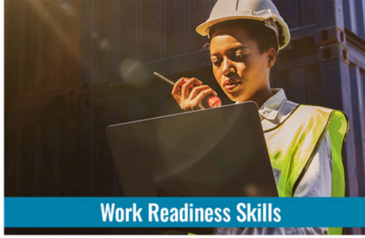
Work Readiness Skills