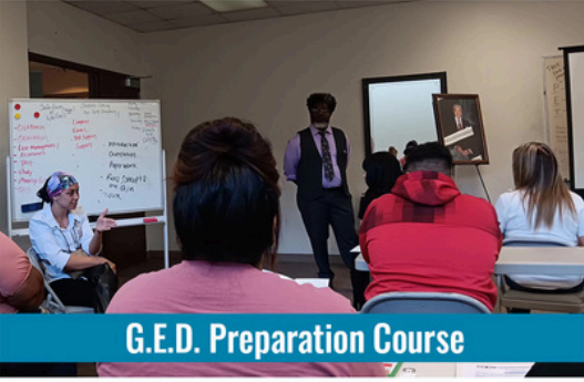
G.E.D. Preparation Course