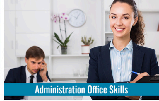
Administration Office Skills